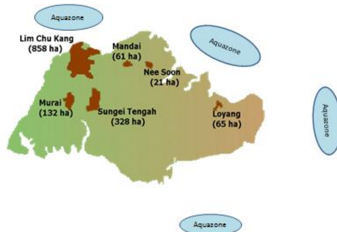
Figure 2. Map of Singapore showing location of agritech parks and aquazones

The country also has marine aquaculture in four designated “aquazones”, with licenses granted for leases of half hectares of sea surface for most of the small “Kelong” fish farms to the largest 19 hectare Barramundi Asia production site. Singapore has over one hundred fish farms, most of which comprise an off-shore floating cage pontoon. Together, they supply approximately 9% of the country’s fish demand.